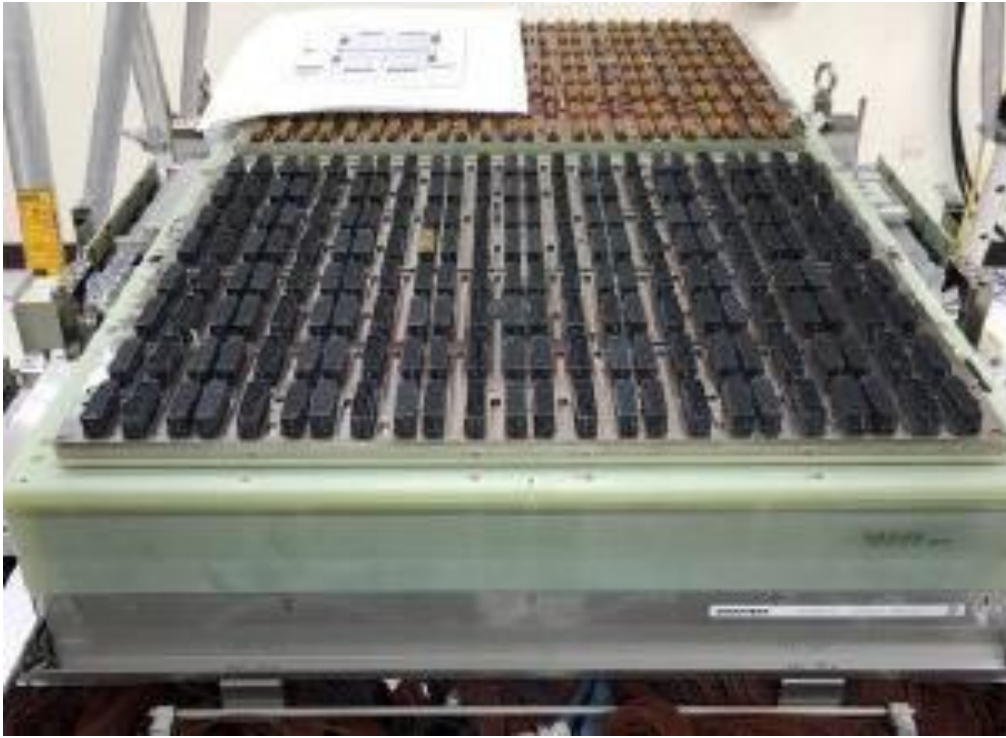
Advantest T5833 Mother Board